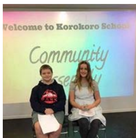
Korokoro School Community Assembly