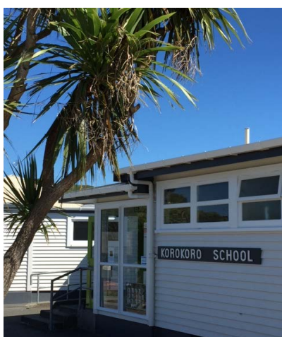
Welcome to Korokoro School